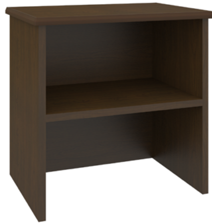
Model: HLBH 20.5W 11.75D 20H

Defined by clean lines and sparkling 3/8" brushed aluminum inlays, Kwalu's Hollywood collection transports you to the Golden Age of American cinema. This glamorous collection includes a bedside, wardrobe, chest, headboard, footboard and so much more. Completely customizable from fit to finish.